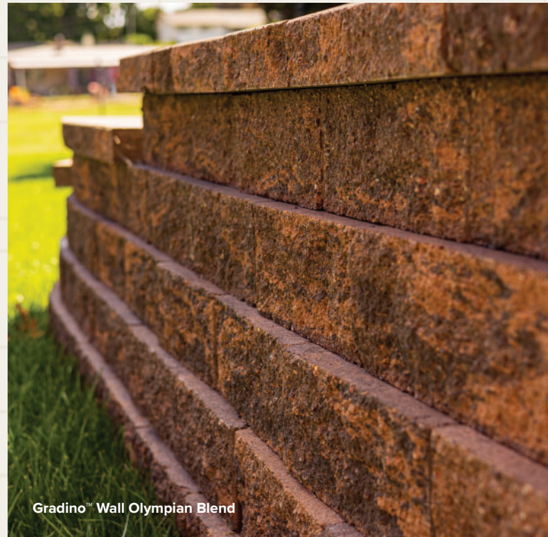
Gradino™ Wall Olympian Blend

503.623.9084 | 360.878.9301 westerninterlock.com