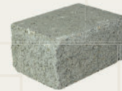
Gradino™ Half Block 203x305x152mm • 7.99x12.01x5.98"