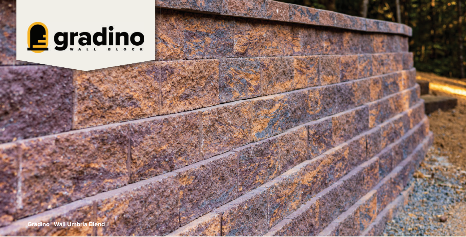
Gradino™ Wall Umbria Blend