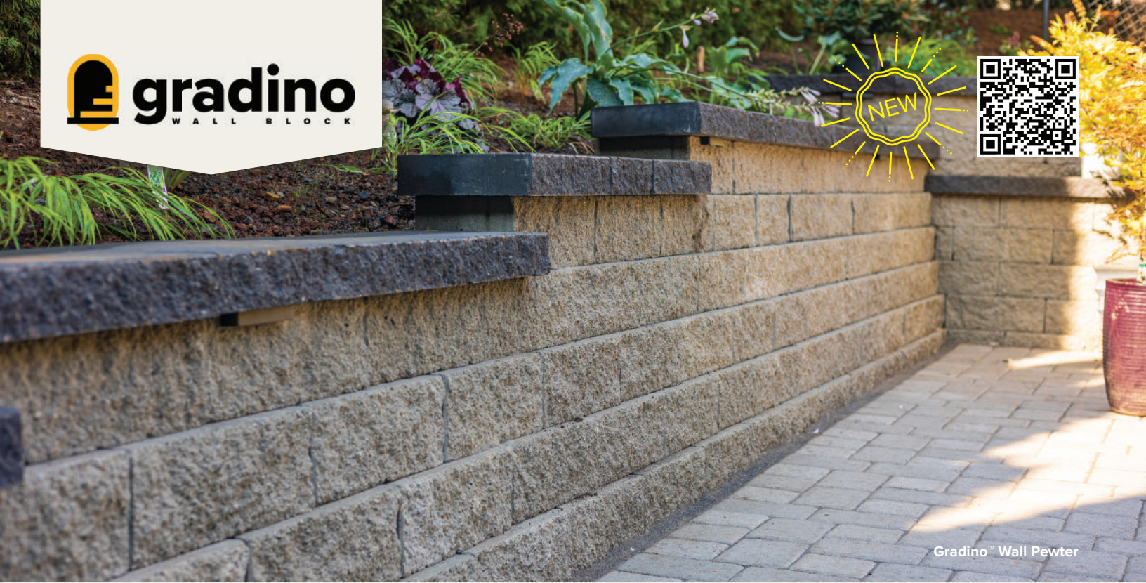
Gradino™ Wall Pewter